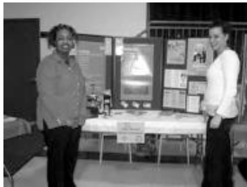
Moms' Night Out - John Howard Youth Employment

We are also grateful to a trio of Nursing Students from Ottawa U. who spear-headed a project to track our most recent graduates in their first year of post-secondary studies. These nurses have prepared surveys, conducted forums and gathered data from these graduates concerning the challenges they are experiencing "after Youville". From their research, we hope to learn ways to improve our current programs and services and how we can better support our graduates after they leave Youville Centre.